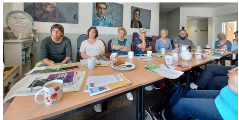
Pastors from The Evangelical Church of Westphalia