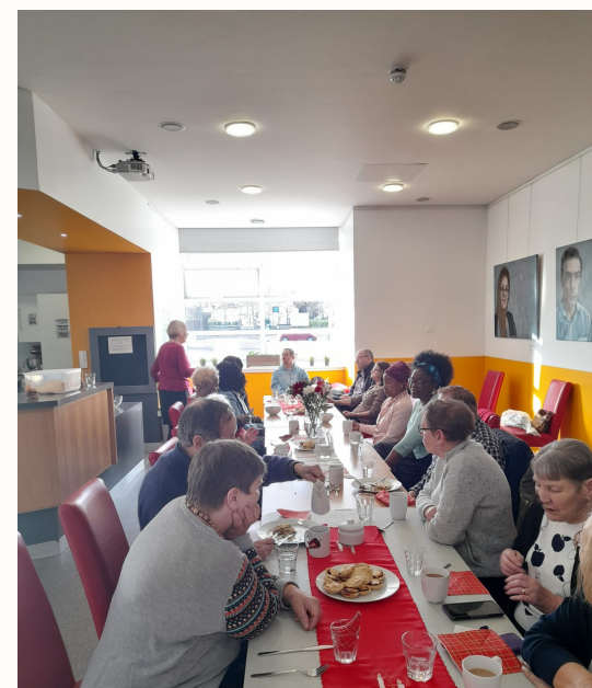
Advent Lunch 2022

The Men's group enjoyed hosting a visit from Castlemilk Parish Church Men's group after their visit to them. Plans are afoot for a monthly get-together from the New Year.