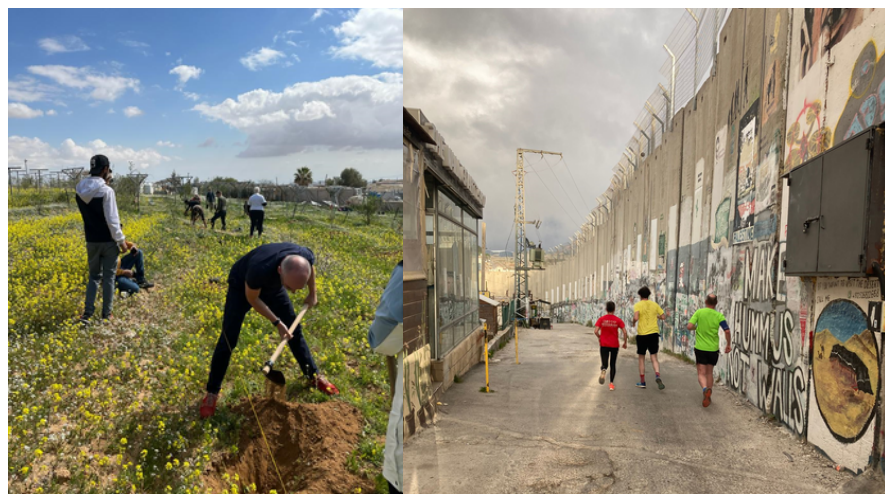
The team help in the fields